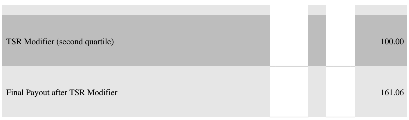
Edgar Filing: CARNIVAL CORP - Form DEF 14A

Based on these performance measures, the Named Executive Officers received the following: